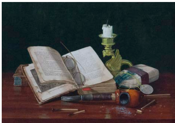
An Interesting Book , 1890. Claude Hirst. Canton Museum of Art Collection.