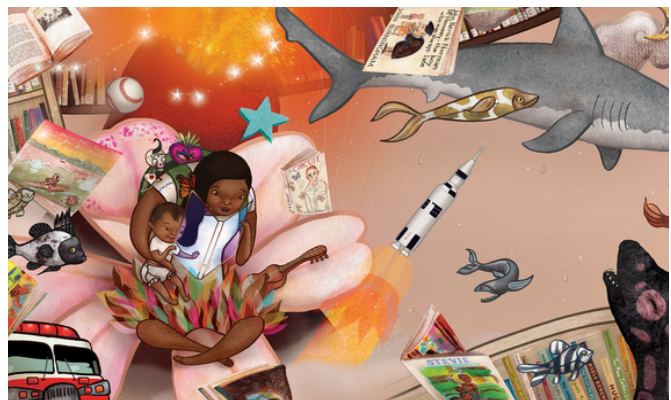
Illustration for Unbelievable. Surprising. 2018. Yuyi Morales. Mixed media digital. Dreamers (New York: Neal Porter Books, Holiday House Publishing, Inc.) 2018. Collection of the artist

"It was not what I left behind, it was what I brought with me, my young child, the stories of my ancestors, the fabric my mother sewed, my strengths, my passions." – Artist Yuyi Morales