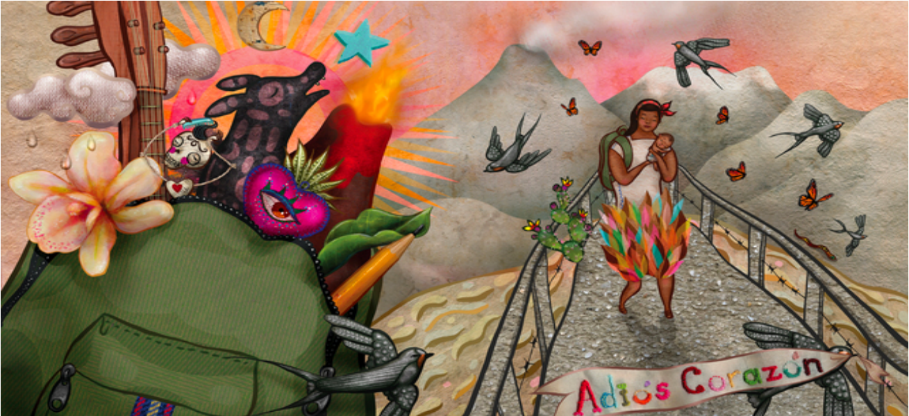
Illustration for One Day We Bundled Gifts in Our Backpack and Crossed a Bridge. 2018. Yuyi Morales. Mixed media digital. Dreamers (New York: Neal Porter Books, Holiday House Publishing, Inc.) 2018. Collection of the artist.

Every voice is unique. Every story is important.