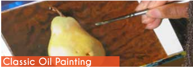
Classic Oil Painting