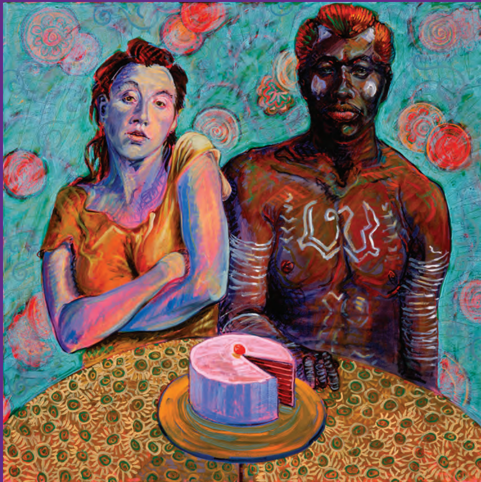
Leslie Shiels (American). Let Them Eat Cake , 2014. Oil on Linen, 48 × 48 in.