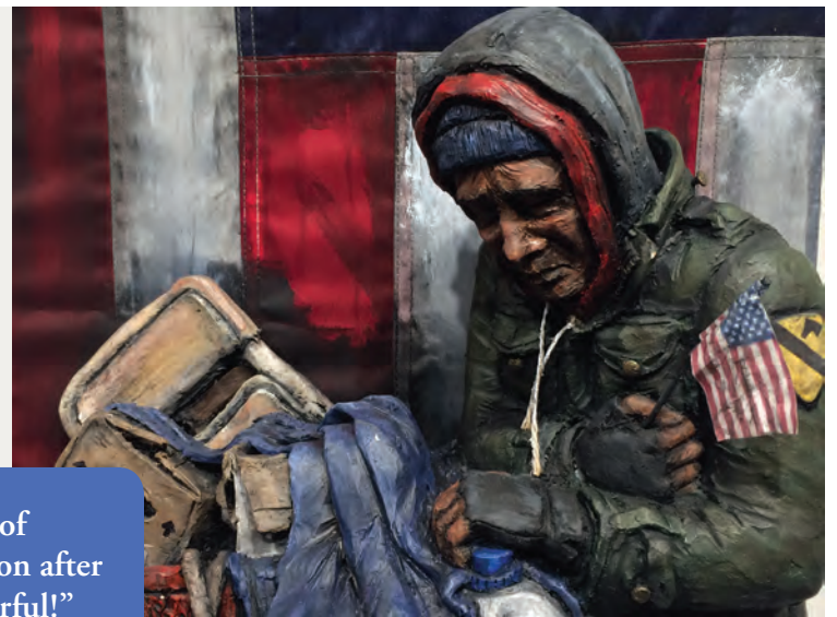
Kelly and Kyle Phelps (American, b. 1972). The Patriot (detail) , Series 3, 2015. Mixed Media / Ceramic, 24 × 36 × 4 in.