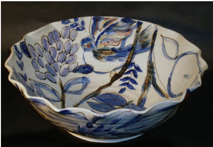
Patricia Schneider (American). Ceramic.