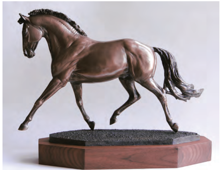
Morgen Kilbourn (American). Quartermeister , 2015. Bronze, 12.5 × 16.5 × 5 in.

A special highlight of our gallery exhibition is the free family day, Art Gone Wild, with animal related art activities for kids, live animals from the Akron Zoo, and more. Join us on May 14 from 10 a.m. to 2 p.m. for this special event that will take place inside the Cultural Center for the Arts and the Canton Museum of Art.