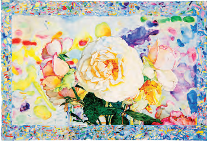
Joseph Raffael (American, b. 1933). Solstice Light , 2013. Watercolor on Paper, 55 × 80 ½ in. Image Courtesy of Nancy Hoffman Galleries © Joseph Raffael.

Featured in the Galleries December 3, 2015 – March 6, 2016