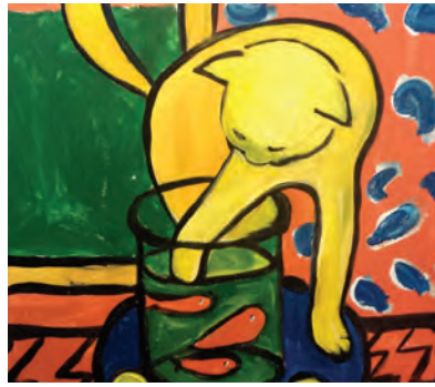
Matisse's Cat June 14, 2016 • 6:00pm

Our artist will make painting easy and fun by instructing you step-by-step through re-creating a beautiful painting. Whether you are an aspiring artist or just looking to explore your creative side, you are sure to go home with a painting that is uniquely yours. Must be 21 or older.