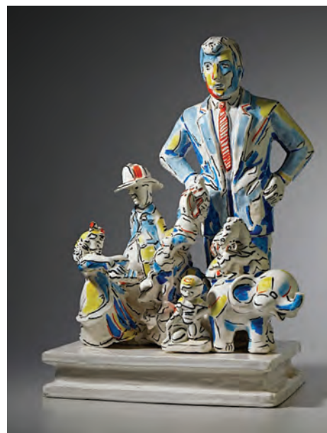
Viola Frey (American, 1933-2004). Untitled Pot Bellied Fireman, 1995. Ceramic, 25 x 18 x 12 in. Canton Museum of Art Permanent Collection.

Viola Frey was born in 1933 in Lodi, California, and died in Oakland, California, in 2004. She is well known for her large, colorfully glazed clay sculptures of men and women, which expanded the traditional boundaries of ceramic sculpture. Frey was one of a number of California artists working in clay in the 1950s and 60s who turned away from that medium’s conventions to produce works with robust sculptural qualities associated with Abstract Expressionism, Pop Art, and what would come to be known as the California Funk movement. Bright colors and heavily textured surfaces are integral to Frey’s work. While some of her art is highly autobiographical in nature, her large figures deal with universal themes of social interaction in a complex world.