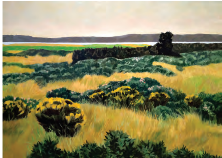
Virginia Cuthbert (American, 1908–2001). Nantucket Landscape , 1963. Oil on Canvas, 38 × 51 in. Canton Museum of Art Permanent Collection.

Admission (includes all exhibits): $8, Adults; $6, Seniors and Students (with valid I.D.); Museum Members, Free; and Children 12 and under, Free. Group tours and discounts available by calling 330.453.7666, 10am – 5pm weekdays.