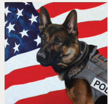
Loreen Pantaleone (American). Jethro , 2016. Acrylic on Canvas, 18 x 24 in.

Learn more about Loreen Pantaleone and "The K9 Hero Portrait Project" at www.k9heroportraitproject.org .