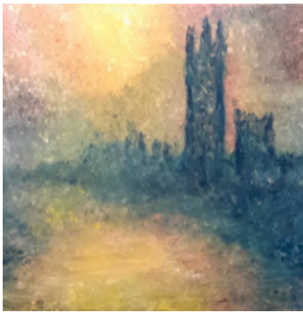
Monet London at Sunset May 17, 2016 • 6:00pm