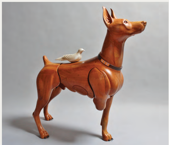
James Mellick (American). Wounded Warrior Dog #6 , 2015. Wood. Image Courtesy of the artist. © James Mellick.