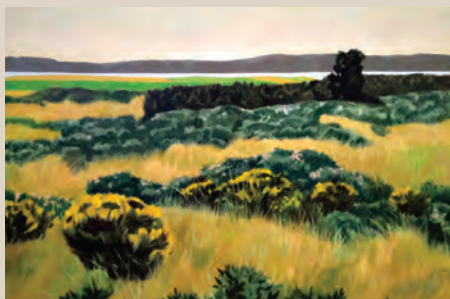
Field and Stream: Nature's Beauty from the Permanent Collection