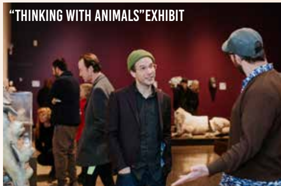
"THINKING WITH ANIMALS" EXHIBIT