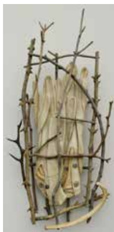
Verity , 2021. Ron Isaacs. Acrylic on birch plywood construction. 16 x 7 3/4 x 2 3/4 in.