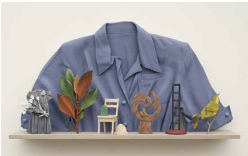
Blue Dress Shelf , 2018. Ron Isaacs. Acrylic on birch plywood construction. 13 3/4 x 26 x 4 1/2 in.

T he masterful trompe l'oeil work of Ron Isaacs is as charming as it is technically brilliant. Using birch plywood, select cutouts, and beautifully painted details which fool the eye, Isaacs creates compositions that pique your curiosity. A sense of surprise and appreciation is experienced when discovering his talent.