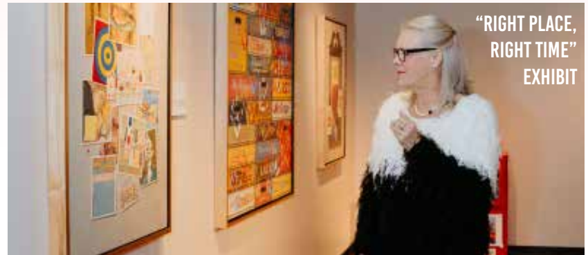
"RIGHT PLACE, RIGHT TIME" EXHIBIT

The Volunteer Angels generously support the Canton Museum of Art's mission to make art accessible to all. Contributions from the Angels provide unrestricted operating funds, assisting the Museum in continuing to develop and present new exhibitions and educational programs for our community.