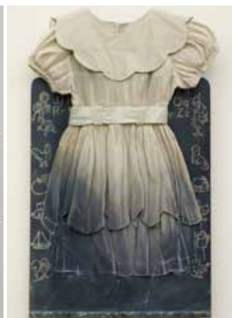
Organdy , 2022. Ron Isaacs. Acrylic on birch plywood construction. 31 x 19 1/4 x 2 1/2 in.