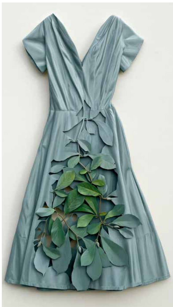
Evening , 2013. Ron Isaacs. Acrylic on birch plywood construction. 44 1/2 x 27 x 3 3/4 in.

Ron Isaacs is represented by Momentum Gallery in Asheville, North Carolina.