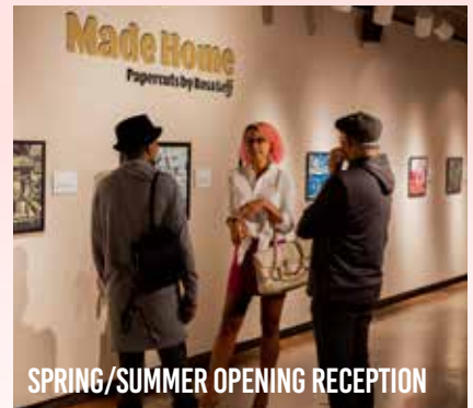
SPRING/SUMMER OPENING RECEPTION