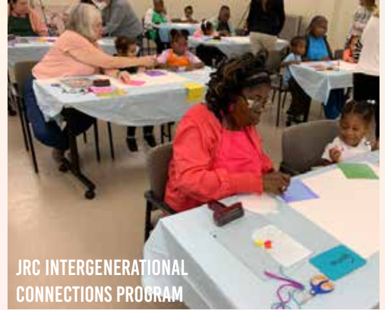
JRC INTERGENERATIONAL CONNECTIONS PROGRAM