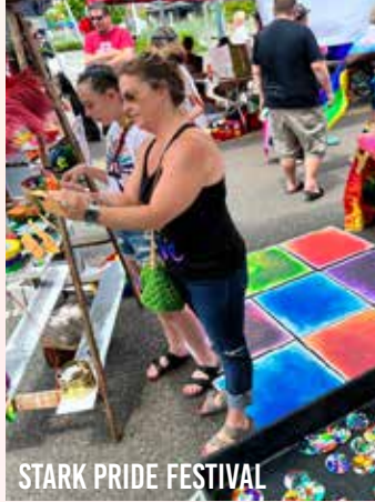
STARK PRIDE FESTIVAL