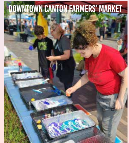
DOWNTOWN CANTON FARMERS' MARKET