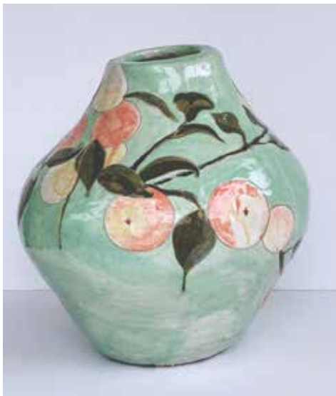
The Seed Merchant , 2022. Susan Mentrak. Ceramic stoneware decorated with colored porcelain slips. 17 in. x 15 in. X 15 in.