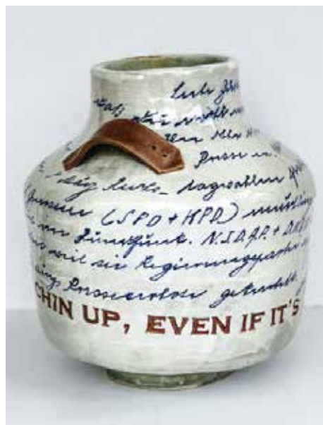
Dear Gäste , 2022. Susan Mentrak. Ceramic stoneware decorated with colored porcelain slips. 15 in. x 11 in. x 11 in.