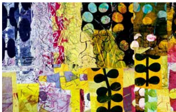
(top above) Sky Trippers , 2021. Dinah Sargeant. Cotton fabric, thread, embroidery floss, recycled produce netting and cotton batting. 96 x 70 in.