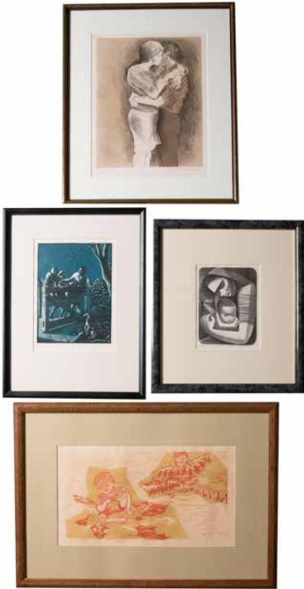
(top) Embrace , 1973. Raphael Soyer (American, 1899-1987). Etching on sepia paper, 13 ¾ x 10 ¾ in. Canton Museum of Art Permanent Collection. Purchase, 78.2.