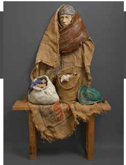
(top center) Address Unknown , 1989. Susan Grabel (American, b. 1942). Ceramic and wood. 19 x 48 x 24 in. Canton Museum of Art Permanent Collection, Gift of Susan Grabel, 2023.26.