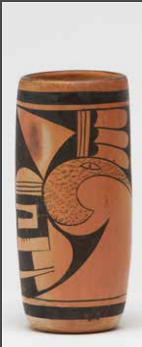
Untitled , n.d. Unknown Hopi Artist. Ceramic, 4 x 4 x 9 1/2 in. Canton Museum of Art Permanent Collection, Gift of Warren McCullough in memory of Marjorie McCullough, 2023.11.