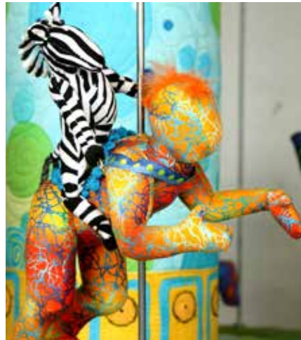
When Ponies Dream (detail), 2013. Susan Else. Collaged and quilted cloth over armature, motorized with lights and audio, 31 x 41 x 31 in.