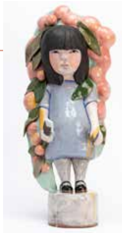
The Quiet Dragon , 2023. Susan Mentrak (American, b. 1969). Ceramic with colored porcelain slips and underglaze. 24 x 10 x 10 in. Canton Museum of Art Permanent Collection, Purchase, 2023.9.