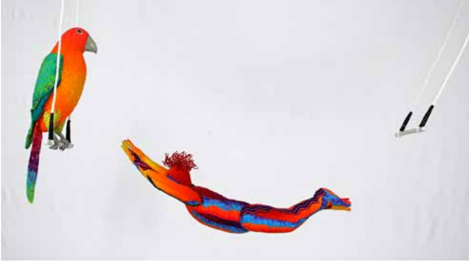
Wrong Universe , 2017. Susan Else. Collaged and quilted cloth over armature, nylon cord. 58 x 42 x 16 in.