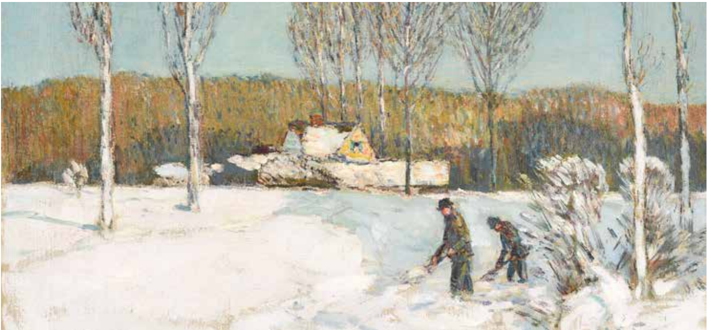
Shoveling Snow, New England, 1905. Childe Hassam (American, 1859-1935). Oil on canvas. 18 x 22 in. Collection of the Huntington Museum of Art, Huntington, West Virginia.

By 1900, Hassam had emerged as one of the country's leading Impressionists. His complete mastery of the style is evident in the shimmering colors and broken brushwork of Newport Waterfront of 1901. Hassam also became known for painting other harbors along the New England coast and for nostalgic winter landscapes filled with intense sunlight. The firm rendering of the trees and distant landscape in Shoveling Snow of 1905 clearly reflects Hassam's skill at working in a distinctly American form of Impressionism.