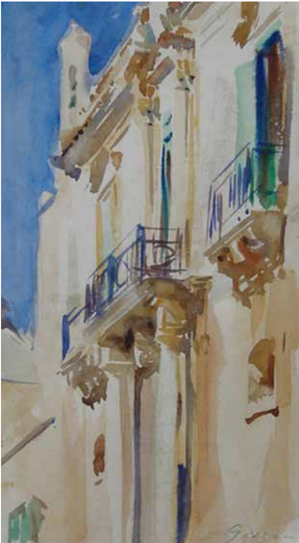
Facade of a Palazzo, Girgenti, Sicily, 1901. John Singer Sargent (American, 1856-1925). Watercolor. 10 x 7 in.