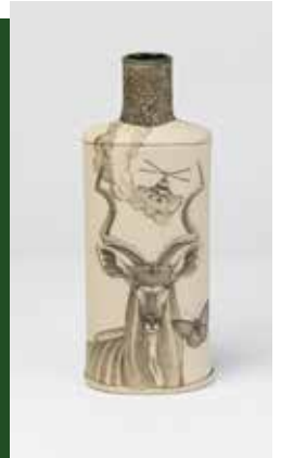
Kudu & Monkeys Bottle, 2020. Dennis Meiners (American, b. 1950). Slab built oxidation fired stoneware. Courtesy of Eutectic Gallery.