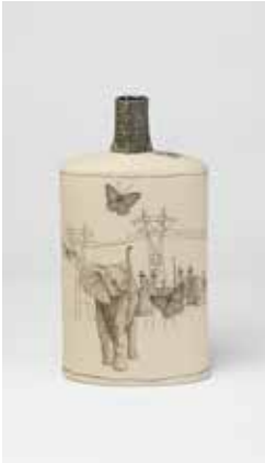
Elephant Bottle, 2020. Dennis Meiners (American, b. 1950). Slab built oxidation fired stoneware. Courtesy of Eutectic Gallery.