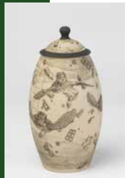
Sea Turtles & Plastics Jar, 2020 Dennis Meiners (American, b. 1950). Wheel thrown oxidation fired stoneware. Courtesy of Eutectic Gallery.