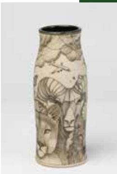
Truck & Critters Vase, 2019. Dennis Meiners (American, b. 1950). Wheel thrown oxidation fired stoneware. Courtesy of Eutectic Gallery. Photo courtesy of Mario Gallucci.