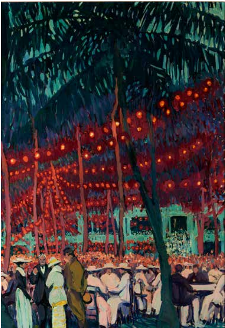
Holiday Evening, Palm Beach , 1918. Jane Peterson (American, 1876-1965). Oil on canvas. 224 x 18 in. Private Collection, Courtesy of Keny Galleries.

painters who could further her understanding of technique and use of color. She resigned from her teaching position and funded by a wealthy patron, remained in Europe beyond her original trip. She continued her study and worked as an artist. Peterson received her first solo exhibition at the Société des Artistes Français in Paris and later that year at the St. Botolph Club, Boston.