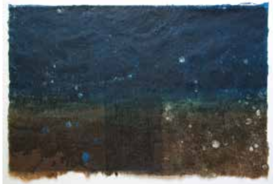
Rain Drops , 2019. Yuko Kimura (American, b. 1968). Etching and monotype on handmade kozo (mulberry) paper. 9 x 13 in. Canton Museum of Art. Verne Collection, Inc. 2020.11.

Rain Drops suggests land and sky and was made with etching and monotype on mulberry paper handmade by Kimura. She then created rain drop texture by spraying or dropping water onto the wet kozo fiber. The vertical hatching with line etching that covers the entirety of the piece shows Kimura’s strong interest in mark making and suggests falling rain.